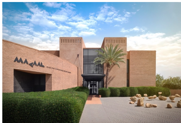
Exterior view of MACAAL

MACAAL showcases art from Morocco and its neighbouring countries across a range of media. In addition to the permanent collection, its temporary exhibition programme focuses on art which engages in a dialogue with the continent, including African and international artists.